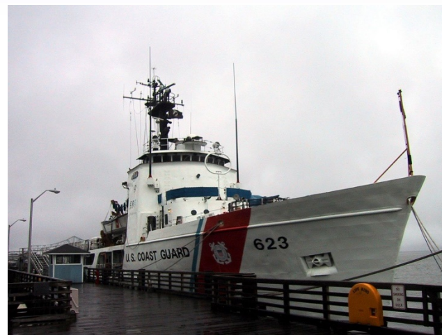
CGC STEADFAST (WMEC 623)