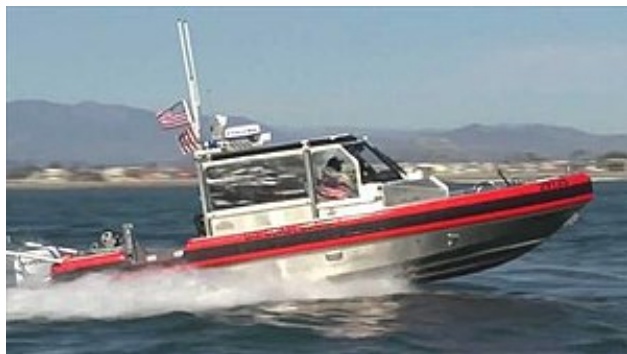
29' Response Boat Small