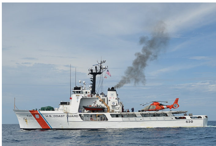
CGC ALERT (WMEC 630)