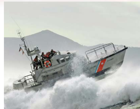
47' Motor Life Boat