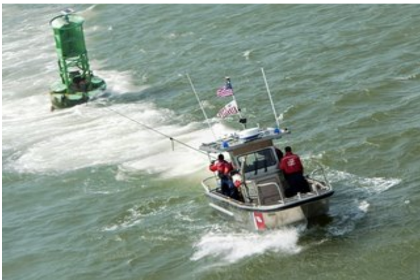
26' Trailable Aids to Navigation Boat