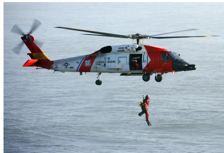
HH-60 Jayhawk Helicopter