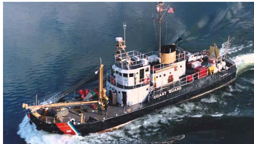
CGC BLUEBELL (WLI 313) Inland Buoy Tender