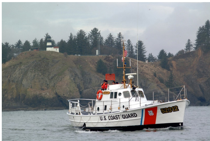
52' Special Purpose Craft – Heavy Weather