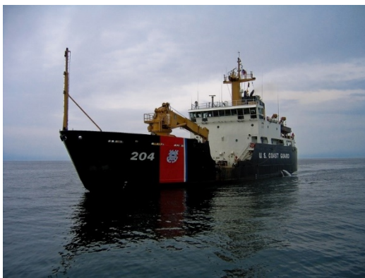
CGC ELM (WLB 204)