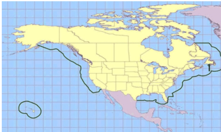
North America ECA Zones

No. The filing of a Fuel Oil Non-Availability Report does not mean your ship is deemed to be in compliance with MARPOL Annex VI. However, the United States government will take into account the information provided in your Fuel Oil Non-Availability Report, as well as all relevant circumstances, to determine the appropriate action to take, if any, in response to the MARPOL Annex VI fuel oil sulfur standard violation.